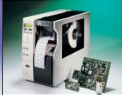
96 XiIIIPlus ™

With a print resolution of 600dpi—the 96 XiIIIPlus —is unmatched at printing precise bar codes, text and graphics information in limited label space. This printer is ideal for applications that require extremely high resolution—labeling electronic components, telecommunication assemblies, computer peripherals, small pharmaceutical packaging, diagnostic research samples, and more.