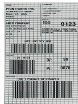
Full Overstrike Example

The upgraded T6000e with ODV-2D allows users to print and encode RFID labels and inspect and grade the quality of printed barcodes in a single pass. Now, one printer can now do the work of multiple devices to create a new level of productivity and cost savings. No longer are two separate machines needed to perform two completely different functions. This is a unique function not available on any other printer currently on the market.