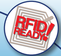
RFID Designed Printer